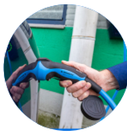
Help finance zeroand low-emission mobility