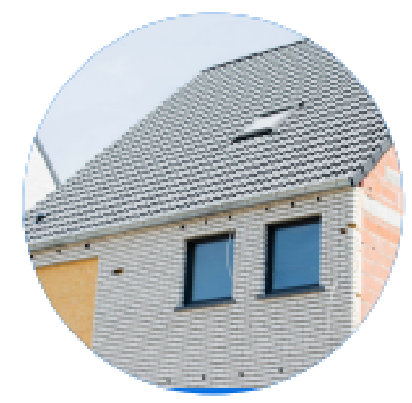
Support investments in energy efficiency and renovation of buildings